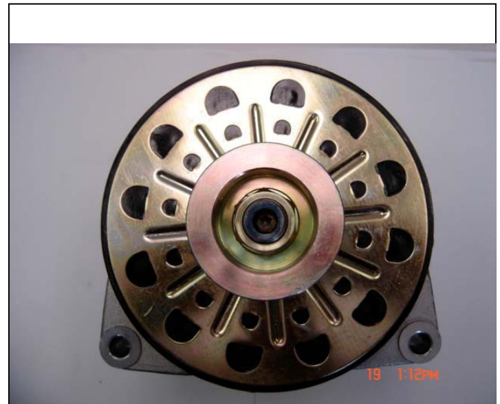
Midsized GM Vehicles