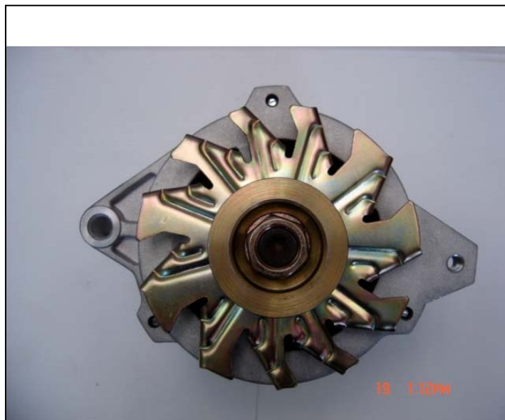
GM / Chevrolet Vehicles (Older Style)